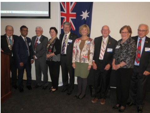
Our New Board.