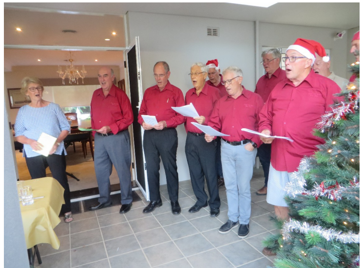
The famous Wagga Male Rugby Choir were in fine voice.