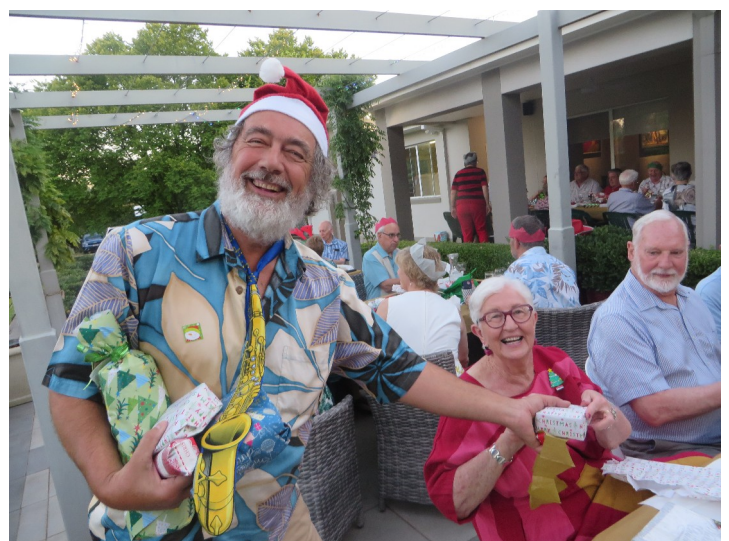
Is that Santa Clause attempting to imitating Peter Smart again?