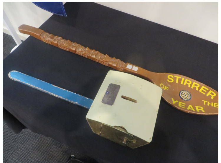
A bit of Club History – the old fines box and Stirrer of the Year Award.