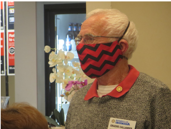
Who is this masked man and what AFL Club does he support?