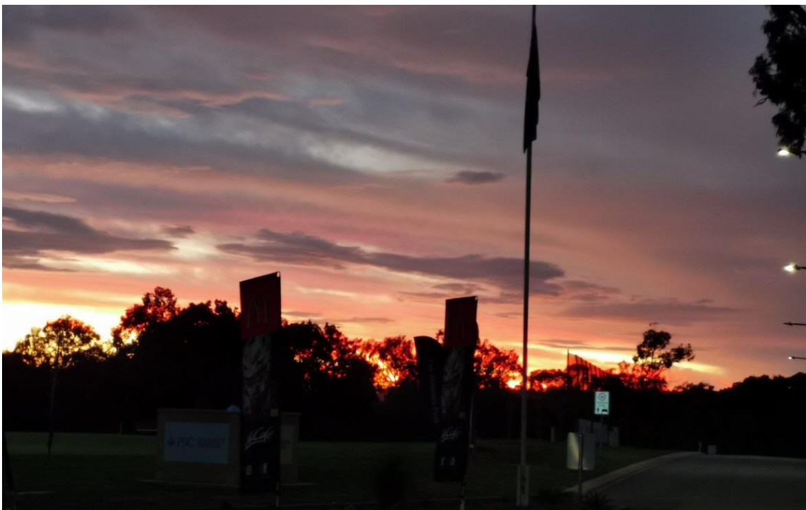
Sunset after the meeting