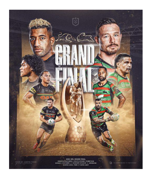
Enjoy the Footy