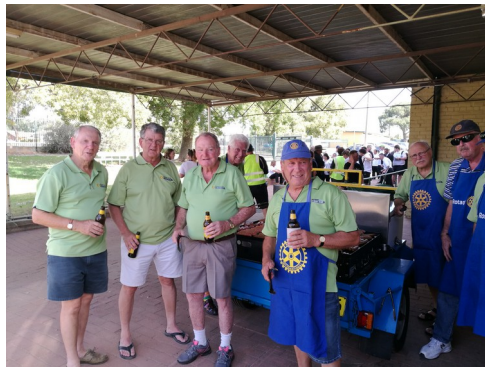
The BBQ Team 'in action' at the Disability Dance Party.