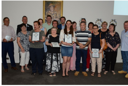
The 2019 Shine Award Recipients.