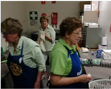
Preparing to serve the Shine Award meals.