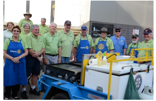
The BBQ Team (plus a few friends) prepare the meal.