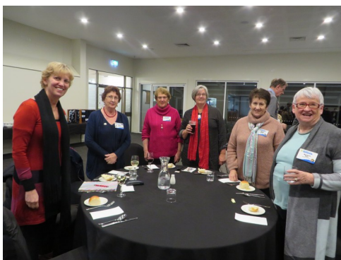
The lady's table (Secret Woman's Business??)