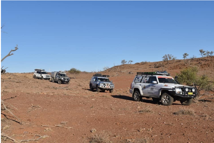
A slide taken from Michael's PowerPoint presentation