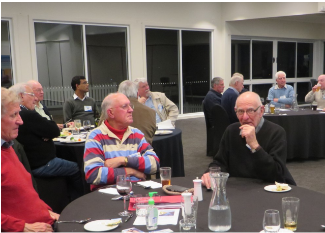
Part of our attentive audience