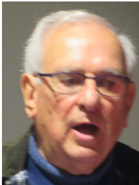
Our 'New President' presides over his first Club Meeting.