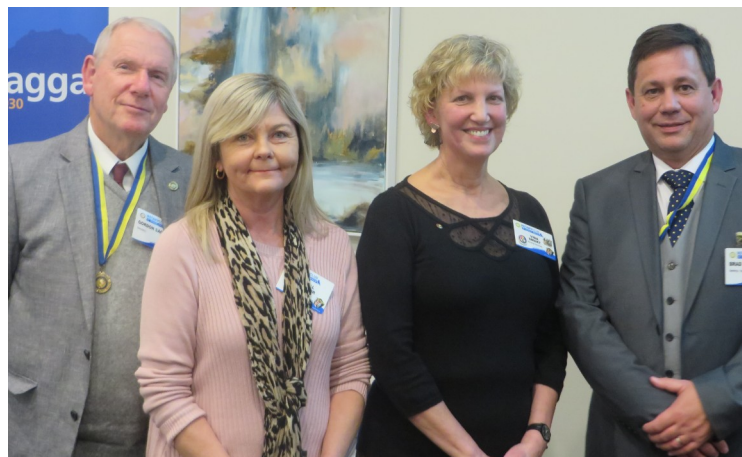
The incoming Board (left) and the incoming Chair-persons of the Service Committees.