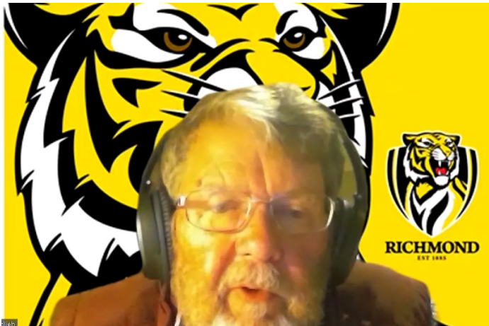
The Richmond Tigers Supporter.