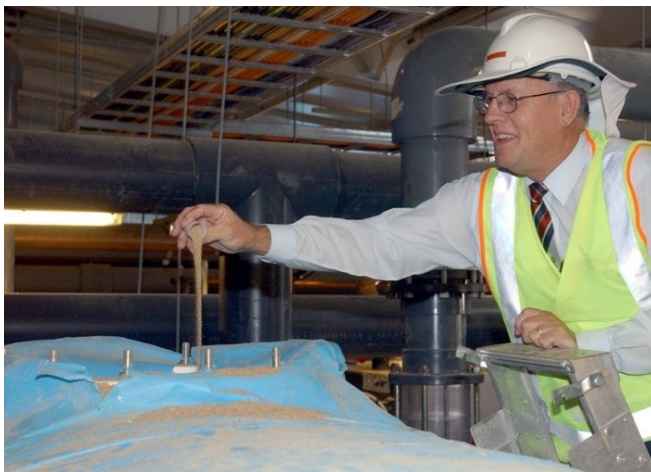
Sands of Time from the Pyramids introduced into the Oasis Sand filters in 2003