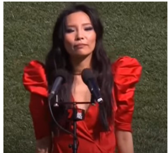
Dami Im leads us in the National Anthem via YouTube.