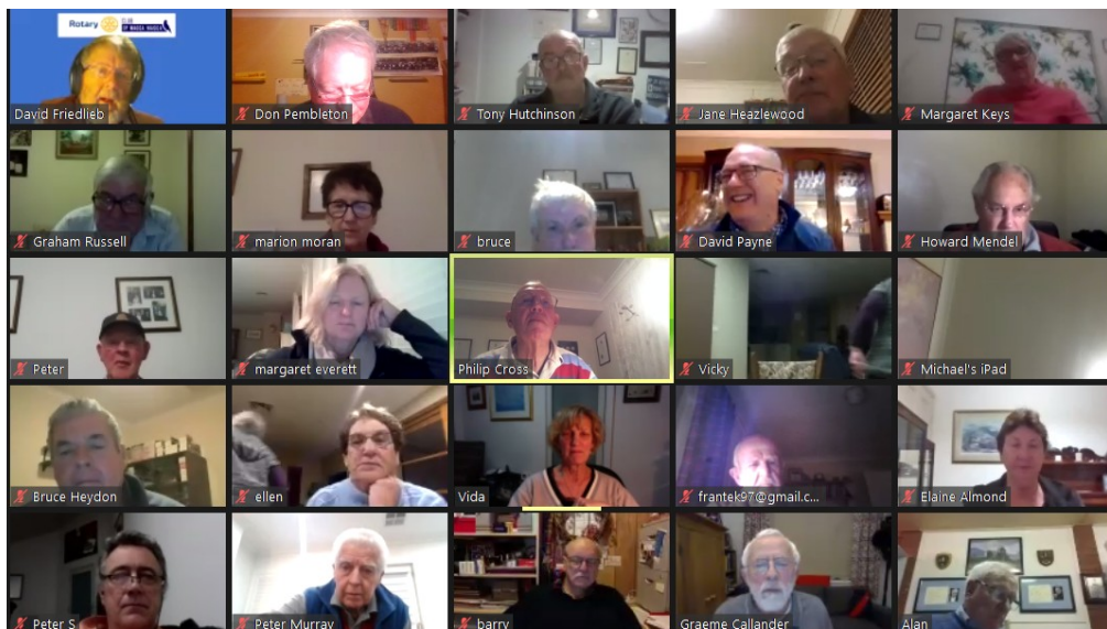
The Zoom Meeting.