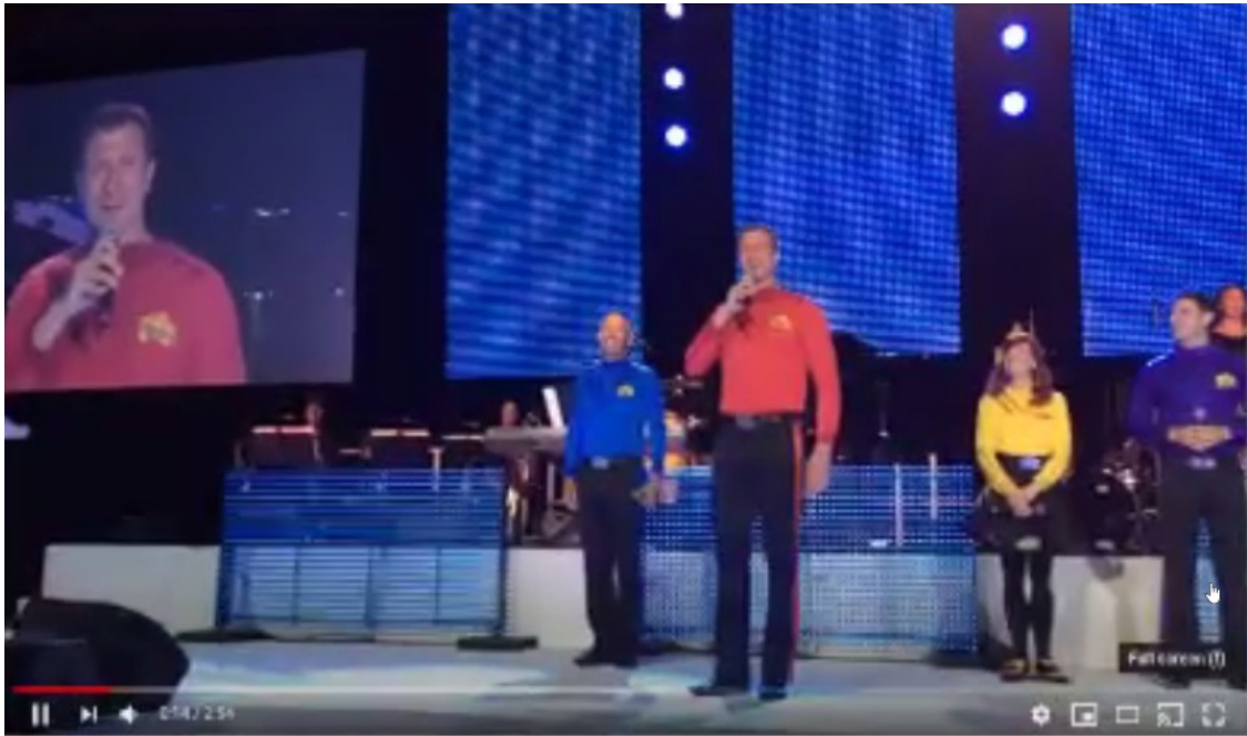
AT LAST! WE'VE FOUND SOMEONE WHO CAN SING OUR NATIONAL ANTHEM IN TIME & TUNE.