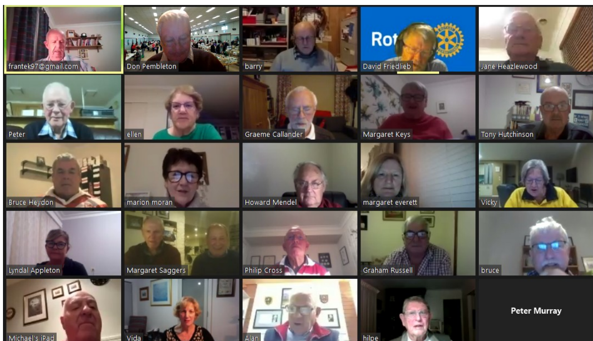
A SCREEN SHOT OF OUR ZOOM MEETING.