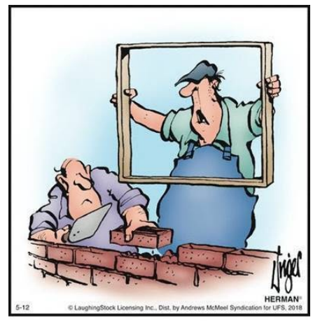
"Can't you work faster? My arms are killing me."