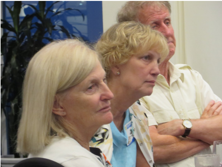
Paying close attention to the presentation from our Key-Note speakers.