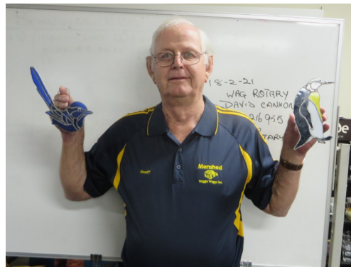
The impressive display of Lead-Lighting.