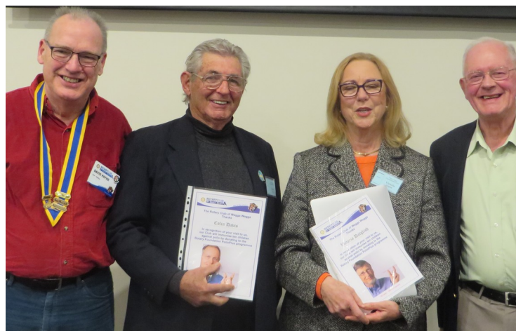
Key-Note Speakers presented with Polio-Plus Certificates