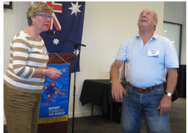
Come in spinner!