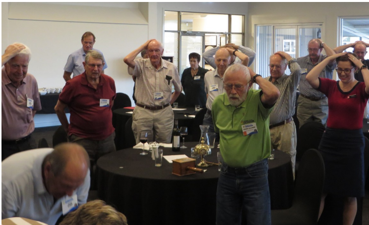
Heads I win - tails you loose.