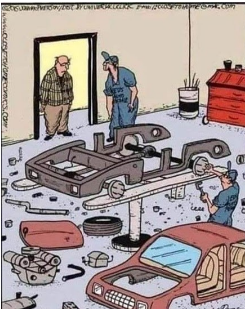
Turns out it was a marble in the ashtray

The Sales girl replied "The Fiction Department is on the other side sir".