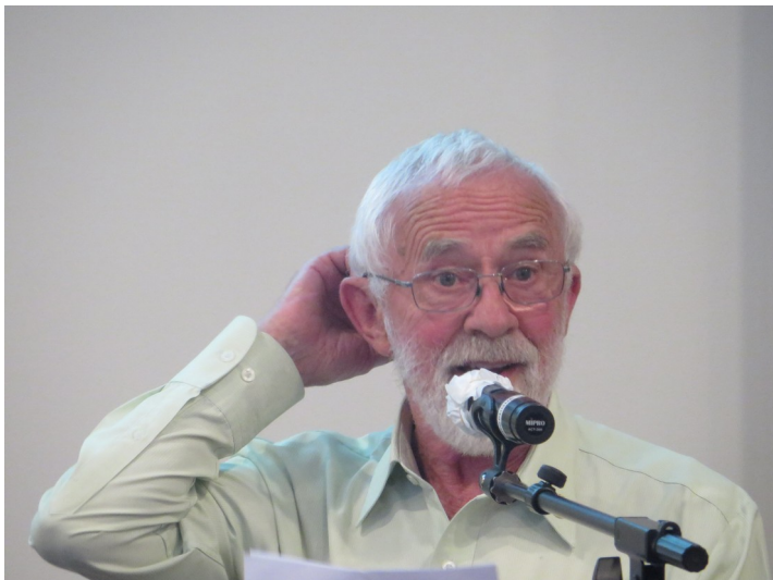
Graeme introduces our Key-Note Speaker – I think we worked together in 2008.