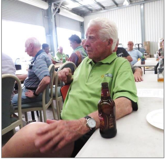
It was a warm old night