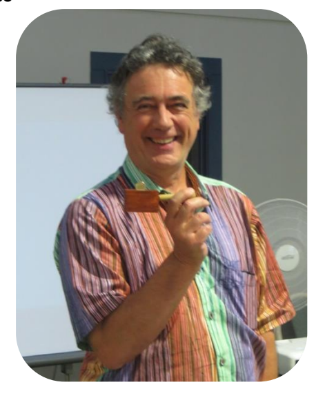
Smart-Arse Finesmaster award winner