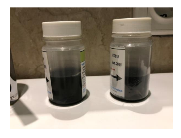
Bore water from Dili used in household