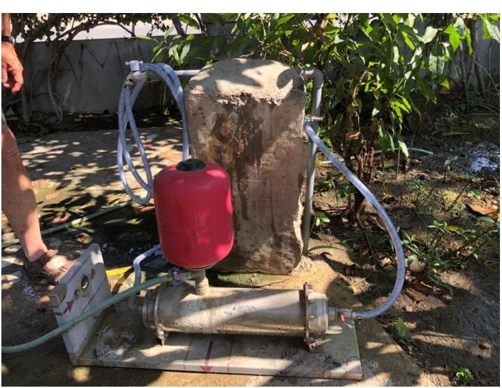
Howards filter on trial on a bore.