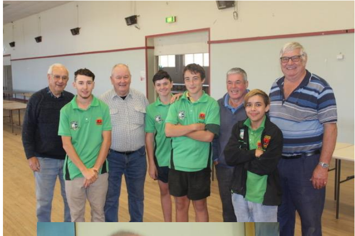
Clontarf Boys in Action last week