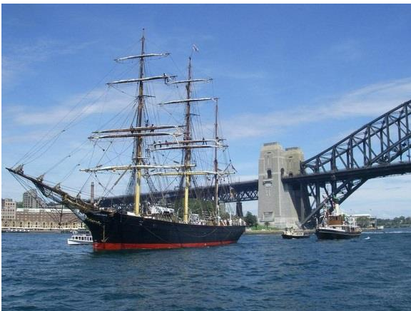
The James Craig