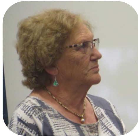
Eyes up - the zoom pose