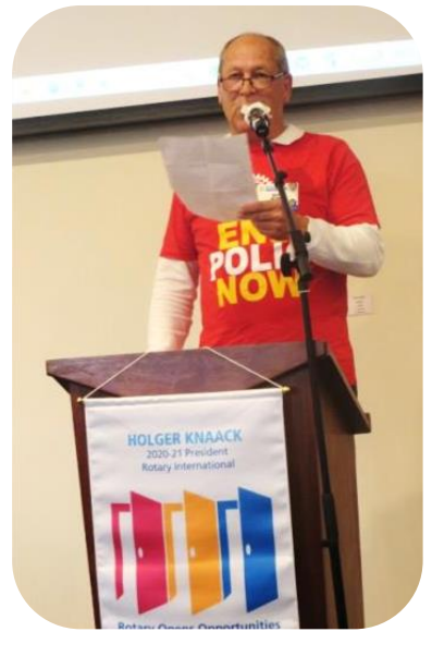
My word he has become tall