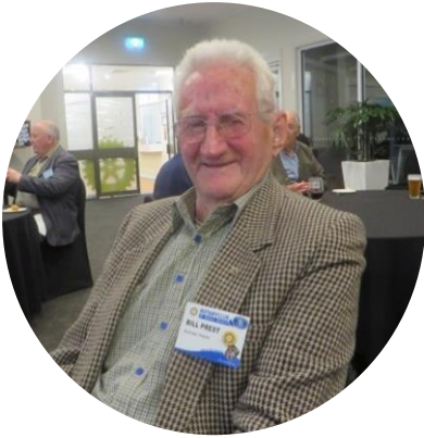
88 not out !