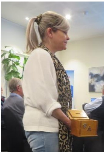
Come on you lot – Pay up !