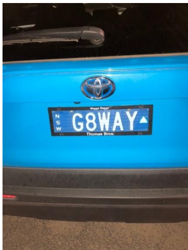
Seen in the carpark ! No – not that G8way