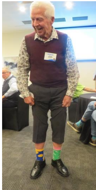
Peter's Happy Socks