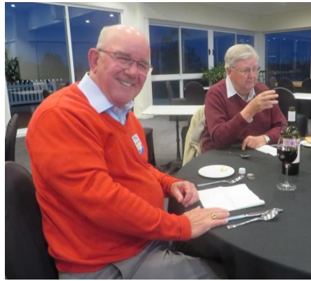
Seen those faces before !