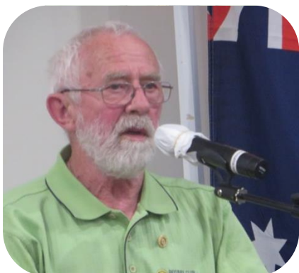
Righto - who's got that banner?