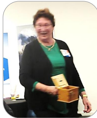
Fine Fine Fine