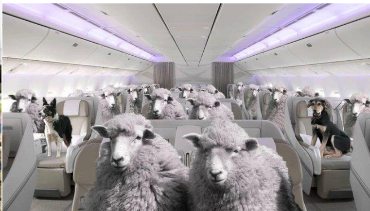
Victorian farmer moving his sheep to the other side of the border via a stop over at a Sydney hotel for a 2 week quarantine period. (Thanks to Coolamon Rotary).