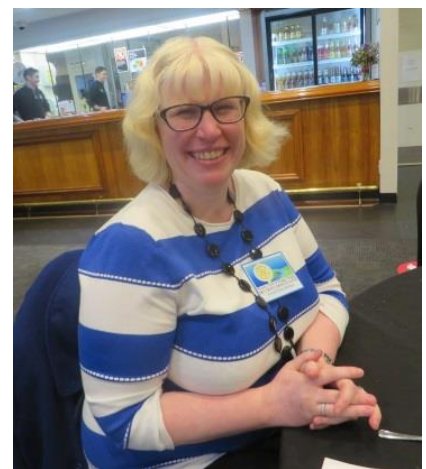
The New Banner