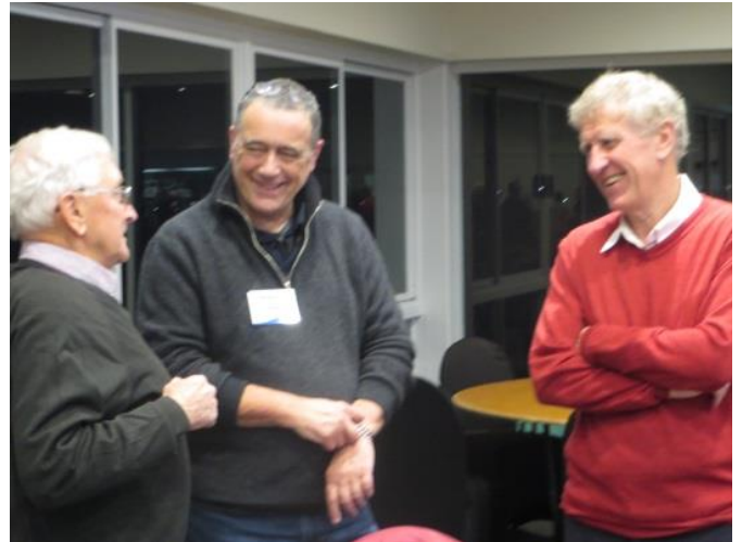
"Cash only thanks"